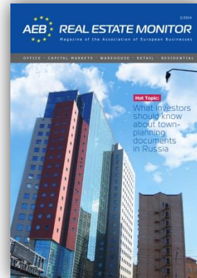
Real Estate Monitor (electronic version)