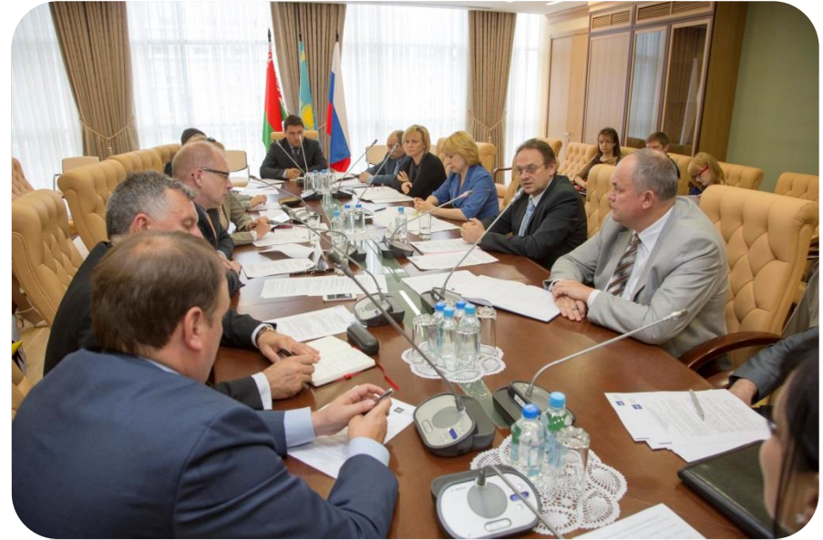
Participants at the meeting

The Minister informed the AEB that the EEC is now in the process of implementing the chapter on express delivery of goods within the Eurasian Union. The first meeting of the working group on this issue was held on 16 June 2014 in the EEC. But the specific provisions will come into force probably only from January 2016. The text of the