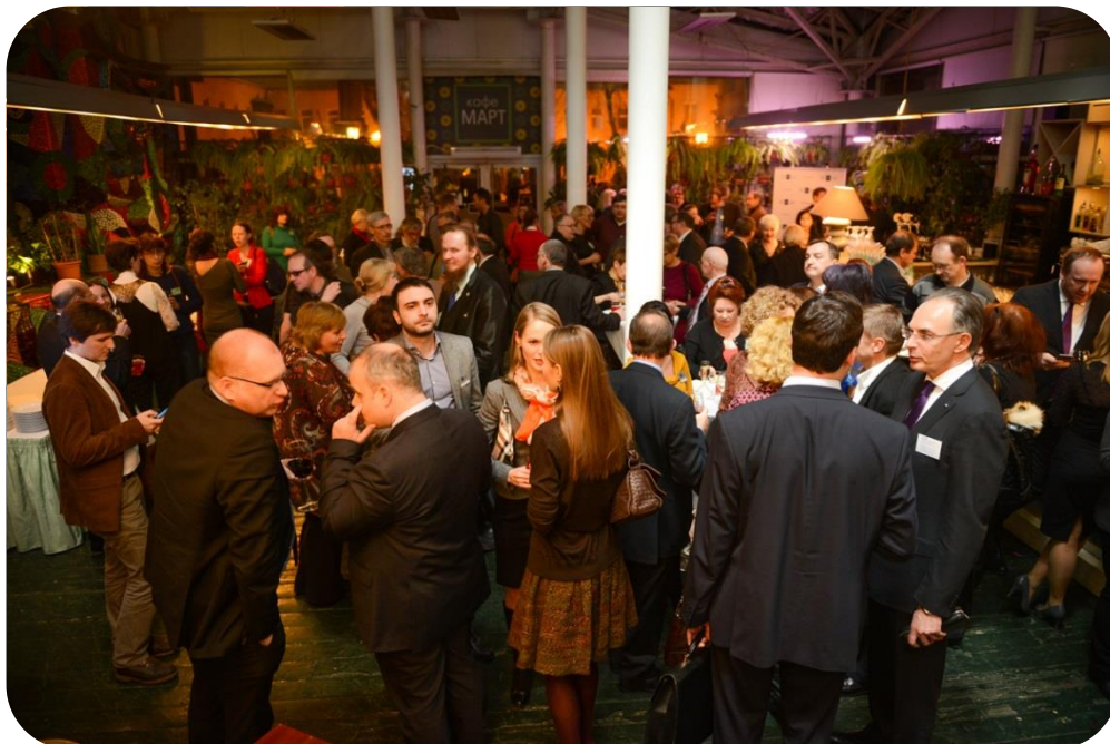
Participants of the event