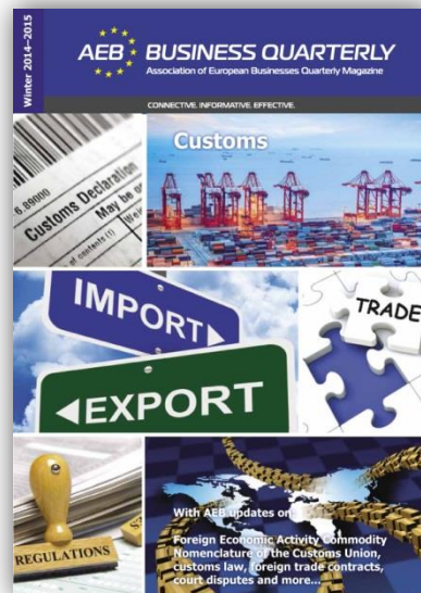
Business Quarterly: Customs