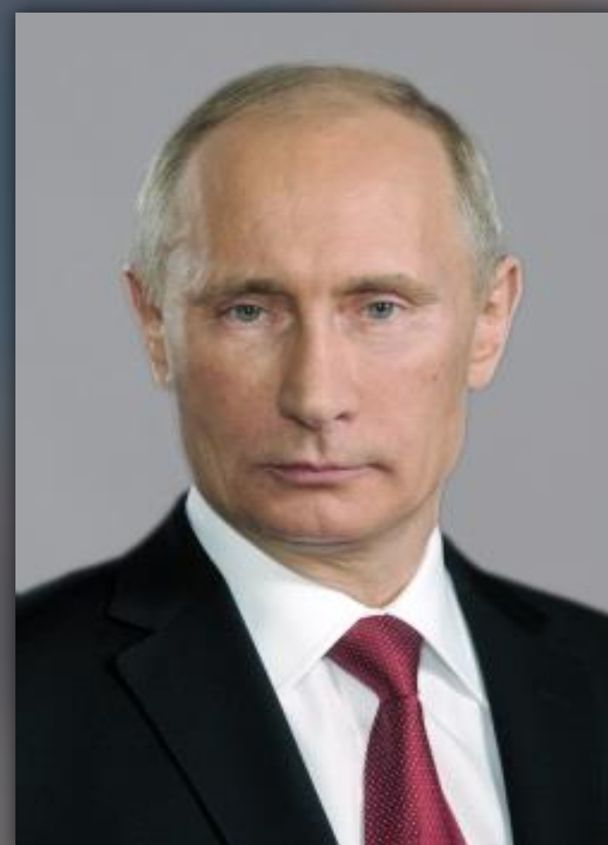
Chairman of our Supervisory Board, The President of Russia Vladimir Putin

The Agency for Strategic Initiatives (ASI) is a non-commercial organization founded in 2011 by the Russian government.