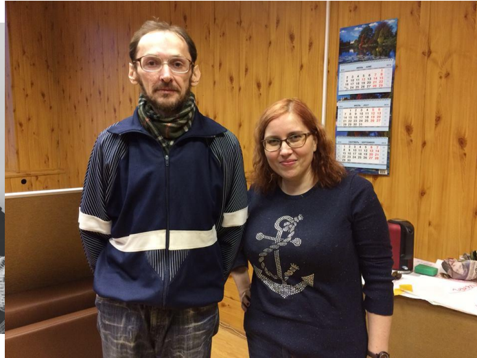
Center for Social Adaptation Elizaveta Glinka – emergency and stabilization shelter

Centers for homeless people, Moscow – group therapies and activities for women