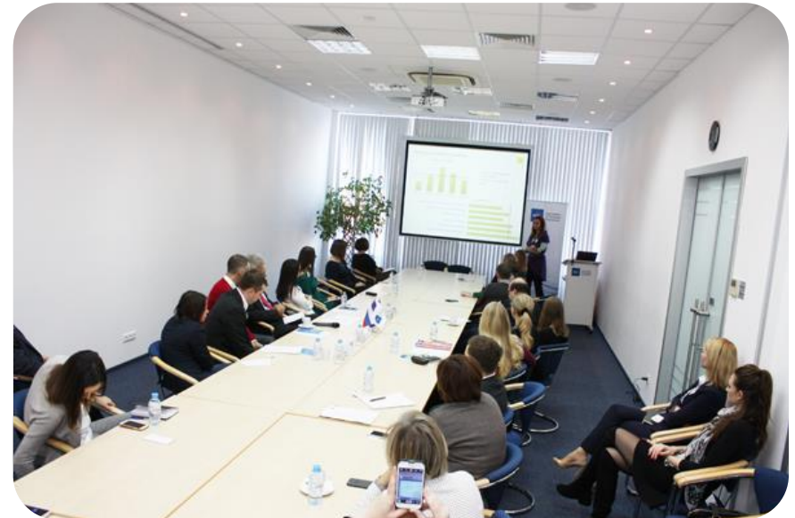
Participants of the event

The presentations are available for downloading in the event archive for authorised visitors.