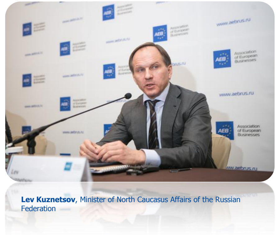
Lev Kuznetsov , Minister of North Caucasus Affairs of the Russian Federation

The photoreport can be found on the AEB Facebook page .