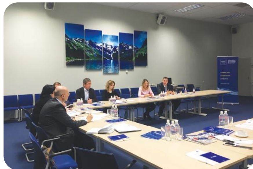
Participants of the event

The participants of the meeting highly appreciated the contribution of the AEB SRC members into the Business schools of Kuban State Technological and Kuban State Agrarian Universities and agreed the continuation of work in the next semester in 2017.