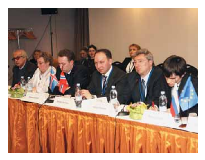
ROUND TABLE "MODERNIZATION OF MEDICINE PROVISION MECHANISM IN THE RF REGIONS" WITHIN THE FRAMEWORK OF THE THIRD NORTHERN DIMENSION FORUM IN ST. PETERSBURG (29 March 2012) WITH THE MAIN SPEAKERS IN THE PHOTO