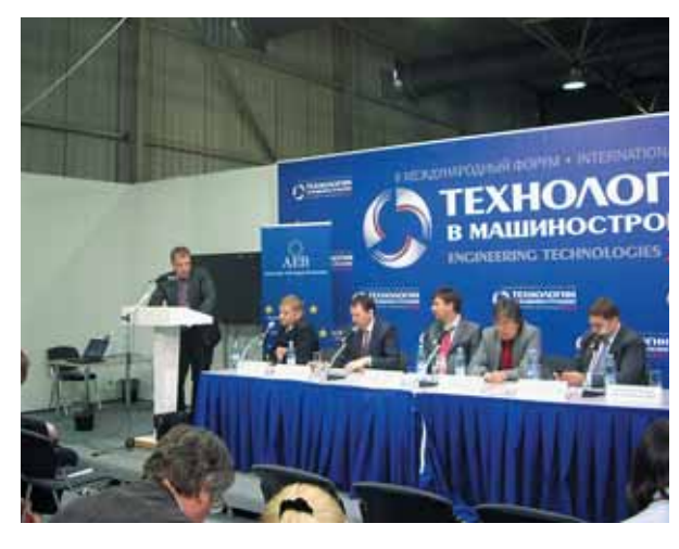
The AEB organised a round table "WTO & Modernization Perspective of the Russian Machine Building Sector" at the 2^{ND} International Forum "Technologies in Machine Building-2012", 28 June 2012.