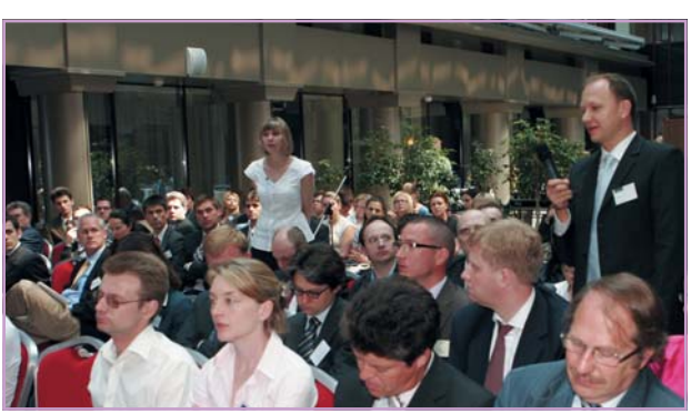
Briefing by HE Tomas Bertelman, Ambassador of Sweden to the RF Priorities of the Swedish EU Presidency. July 7<sup>th</sup>, 2009